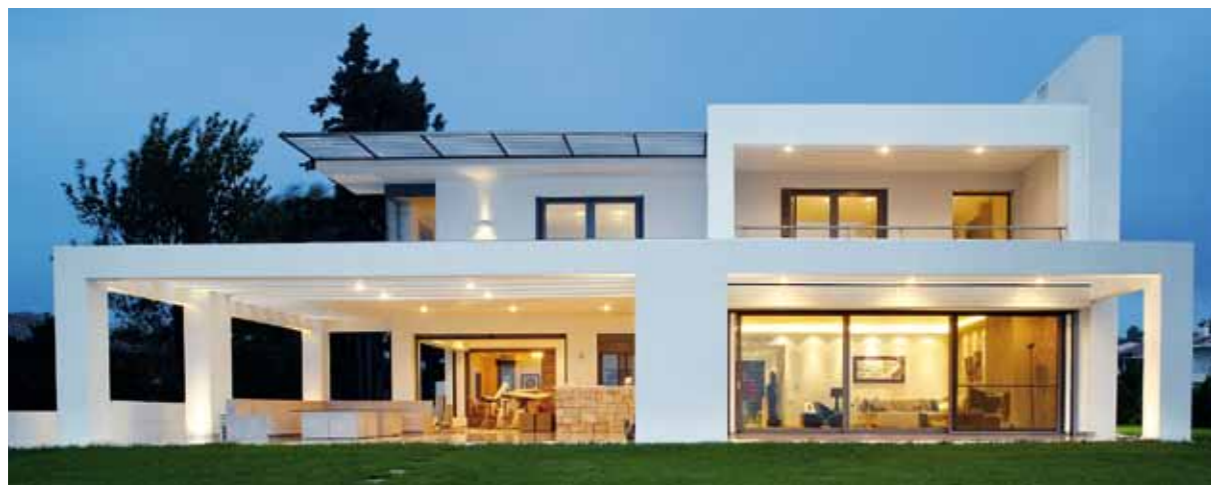
You can choose from doors that slide, lift-and-slide, tilt-and-slide or fold

Imagine sliding open a door on a warm sunny morning and finding summer filling your house. Or perhaps you're having a party and want to allow a roomful of guests to spill out into the garden in the cool of the evening?