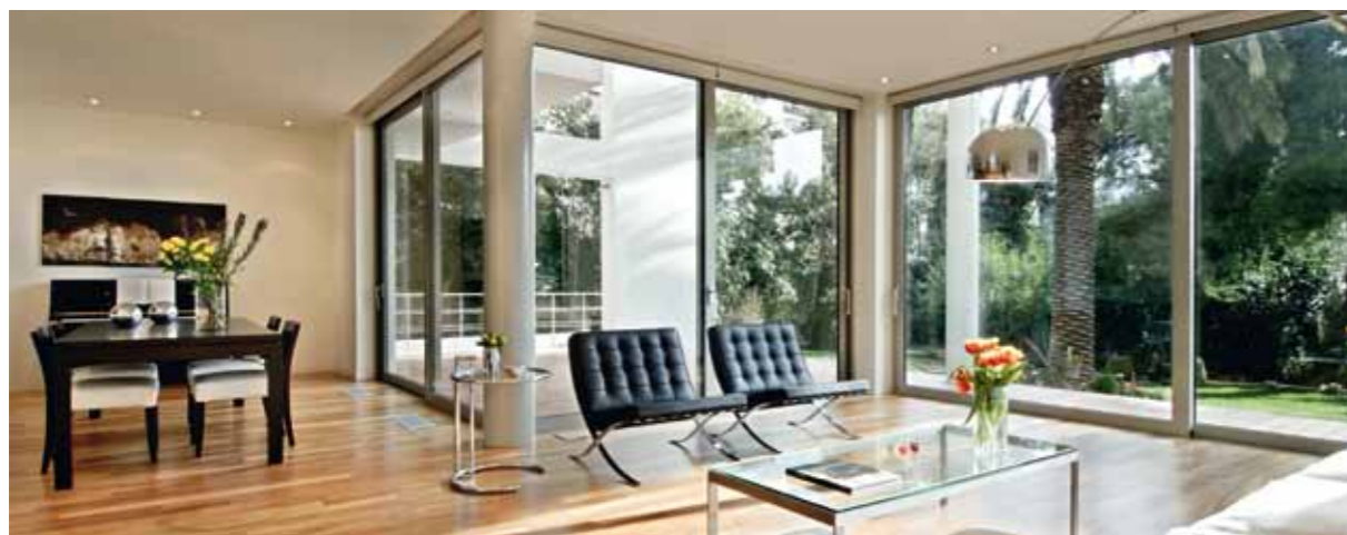
Narrow sight lines allow maximum light to flood into a room