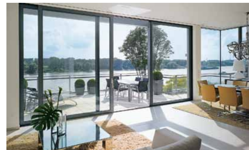
Select an arrangement up to six leaves (single, double or triple tracks)