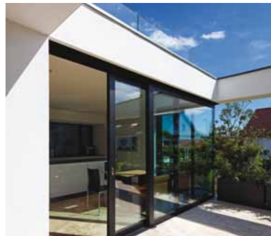
You can specify a different colour on the inside to the outside