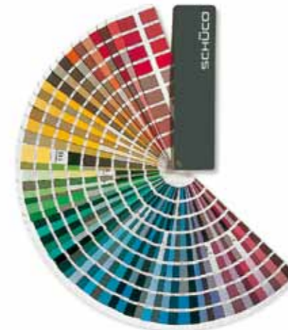
There's a huge choice of colours and finishes