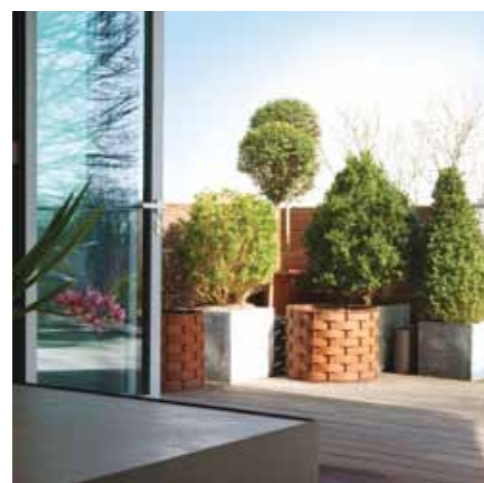
Choice of handles and stainless steel multi-point locks

For the ultimate outdoor experience inside, a Schueco folding door is the clear choice. When fully opened, with its leaves neatly stacked to one side, a typical door allows a clear opening of as much as 95% – it opens up your home and invites the garden to join you inside.