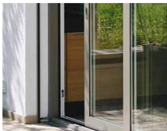
Multi-point locking for maximum security

Finally, we've addressed security concerns by fitting multi-point locking to ensure a level of burglar resistance up to EN V 1627 Class 2. So now you can enjoy the view and total peace of mind.