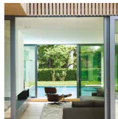
Perfect for internal and external use

A Schueco sliding door is a window onto the world. It opens and closes effortlessly, disclosing great views onto the garden or patio. It allows you to enjoy all the fresh air you want while simultaneously ensuring that you're warm and comfortable when the weather turns cold.