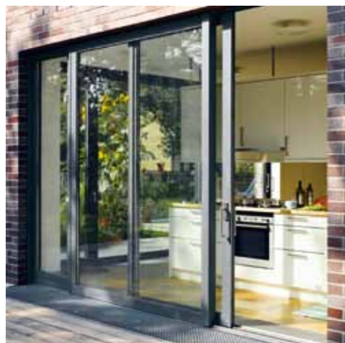
A lift-and-slide door with low threshold