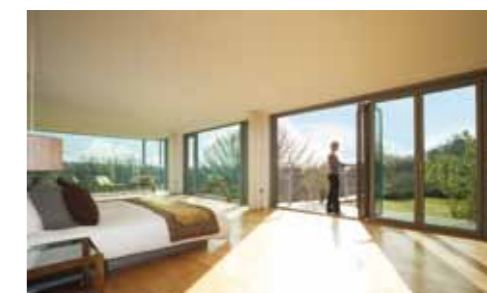
... glides back on precision rollers ...