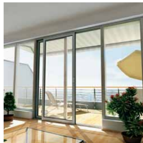
Draught-free and watertight