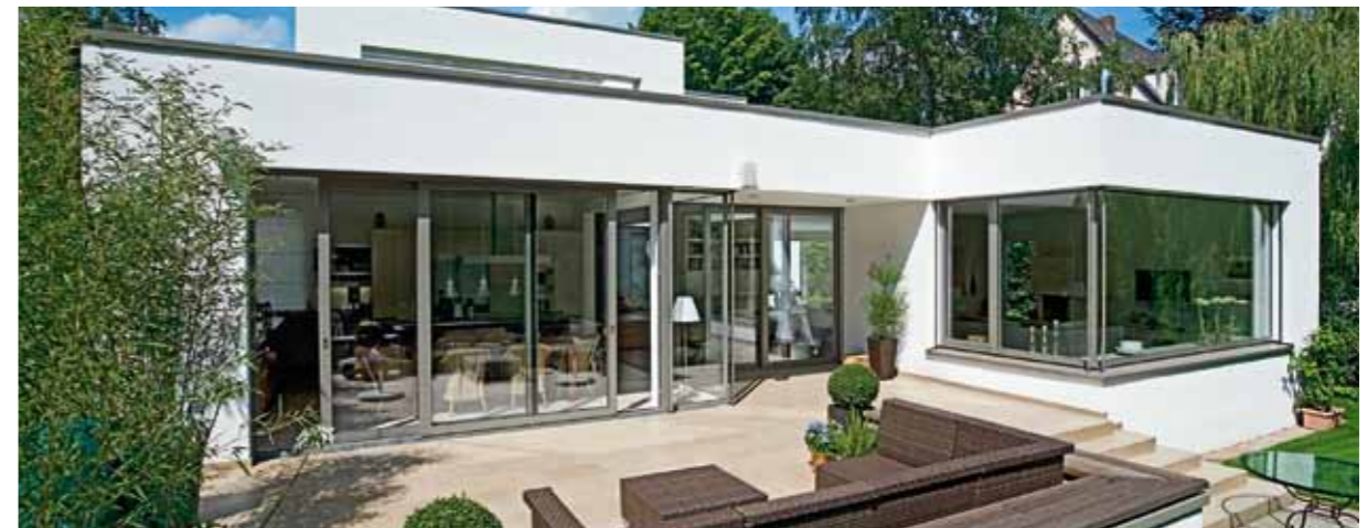
Different levels of security can be achieved up to EN V 1627 Class 2