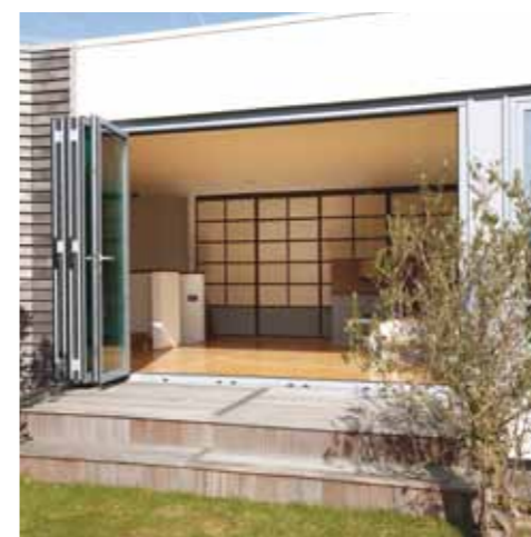
Individual leaves up to 3 m high and 1.2 m wide