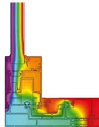
Every door is designed to provide optimum thermal insulation