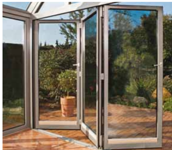
You can have a flush threshold

Every door, whether slide, lift-and-slide, tilt-and-slide or folding